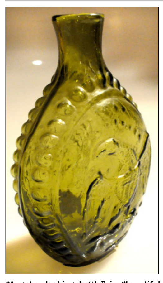
"A gutsy looking bottle" in "beautiful color," the eagle/medallion flask, GII-8, in a brilliant yellow-olive coloration sold for $64,350.