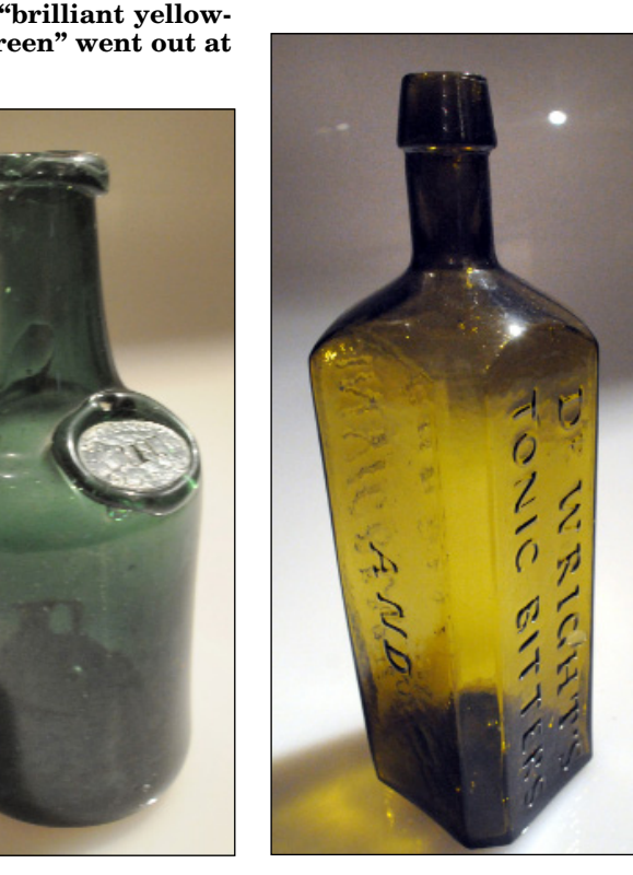
The free-blown Mt Vernon The Dr Wright's Tonic Bitseal bottle in a deep green ters bottle in yellow/olive color brought $26,910. made $14,040.