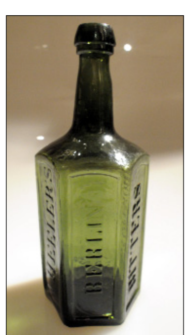
The Wheeler's Berlin Bitters bottle in a "brilliant yellowish grass green" went out at $11,700.