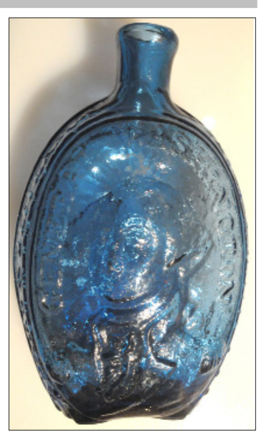
The "firecracker" flask, was termed by auctioneer Norman Heckler, "A great bottle in every way." Condition was exceptional, as was the color, a deep sapphire blue with an inward rolled mouth and a pontil scar. In a pint size, the "firecracker" flask carried an estimate of $40/80,000. Bidding on the lot was brisk, bringing a record price of $100,620, including premium.