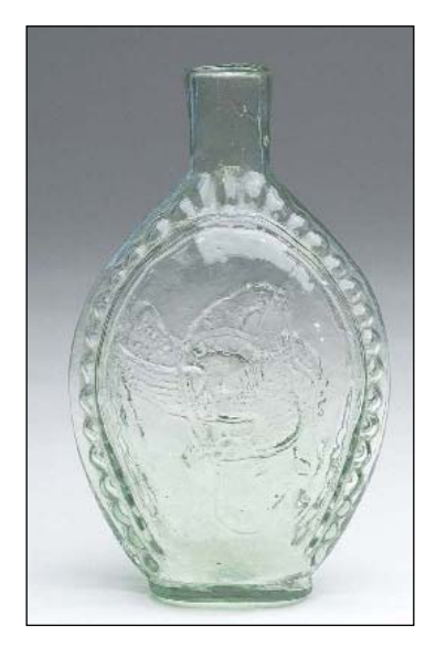
The so-called "Snake of Corruption" flask has an eagle with a snake in its beak. The GII-9 example drew $10,530.

But as impressive as the flask's back story was, its rare brilliant yellow color had an unusual gradation, from yellow to almost clear in the middle of the body. It also had particularly strong embossing. These elements combined for a presale estimate of $5/10,000, and by