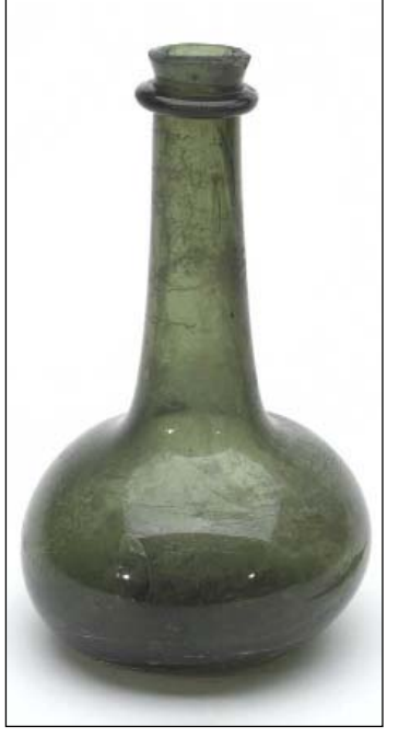
This P.&U.S. Spring Compa- An early shaft and globe retrieved irom Narragansett Bay, R.I., went out ga, N.Y., emerald green mineral www.hecklerauction.com. at $5,850.