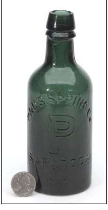
ny (Saratoga, N.Y.) mineral wine bottle from England water bottle, emerald green, in rare size finished at