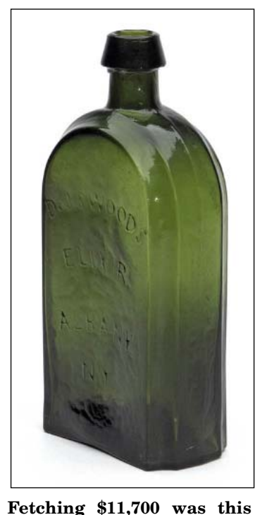
Dr J.S. Woods Elixir medicine bottle (Albany, N.Y.), emerald green with tomb-