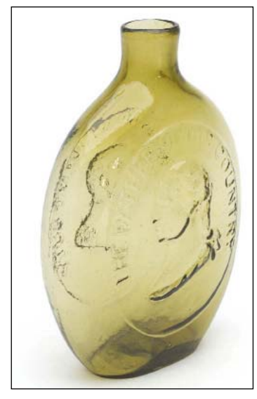
The Washington-Taylor portrait flask (GI-44), made in Philadelphia and dug up in Savannah, Ga., hit $14,040.

the time the dust had settled following an intense battle of determined bidders, the final price reached $14,040.